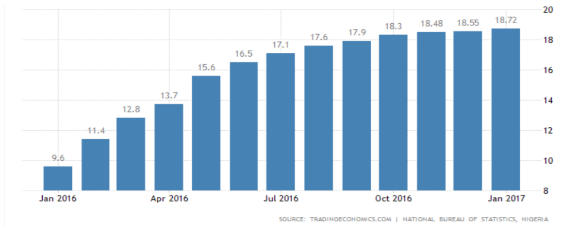
Figure 1: 2016 Inflation rate in 2016 NIGERIA INFLATION RATE Nigeria